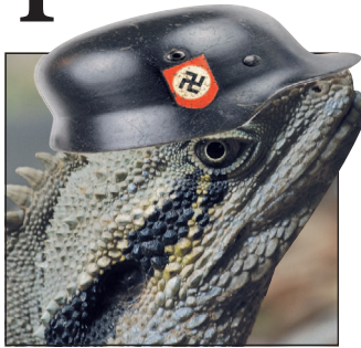
Photo of PM Toned Abbs unavailable due to having not appeared in public since the election.

TONY ABBOTT – Minister for woman's issues and presumably the PM.