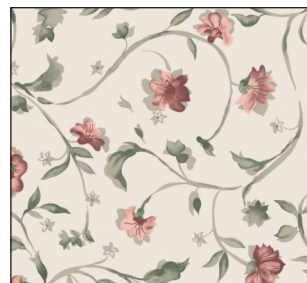
Warren Truss is well adept at disguises: here he mimics floral wallpaper.

WARREN TRUSS – Deputy prime minister, minister for infrastructure and regional development.